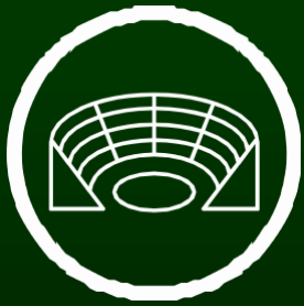
Open Air Theatre