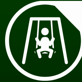
Kid's Play Area