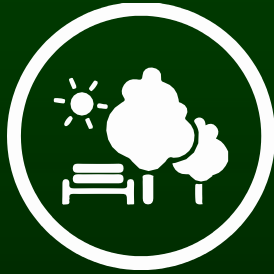
Senior Citizen's Park