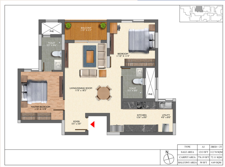
A1 | 2 Bed + 2T