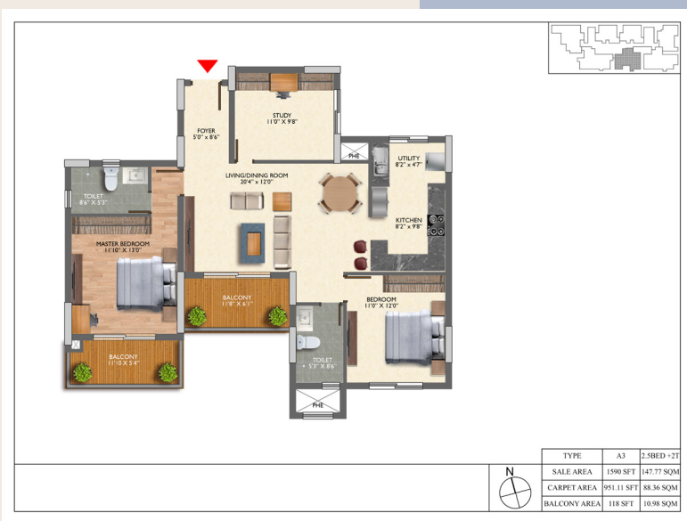
A3 | 2.5 Bed + 2T