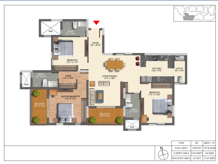
B2 | 3 Bed + 3T