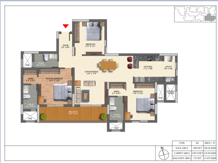
B3 | 3 Bed + 3T