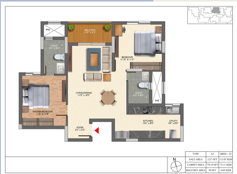
A2 | 2 Bed + 2T