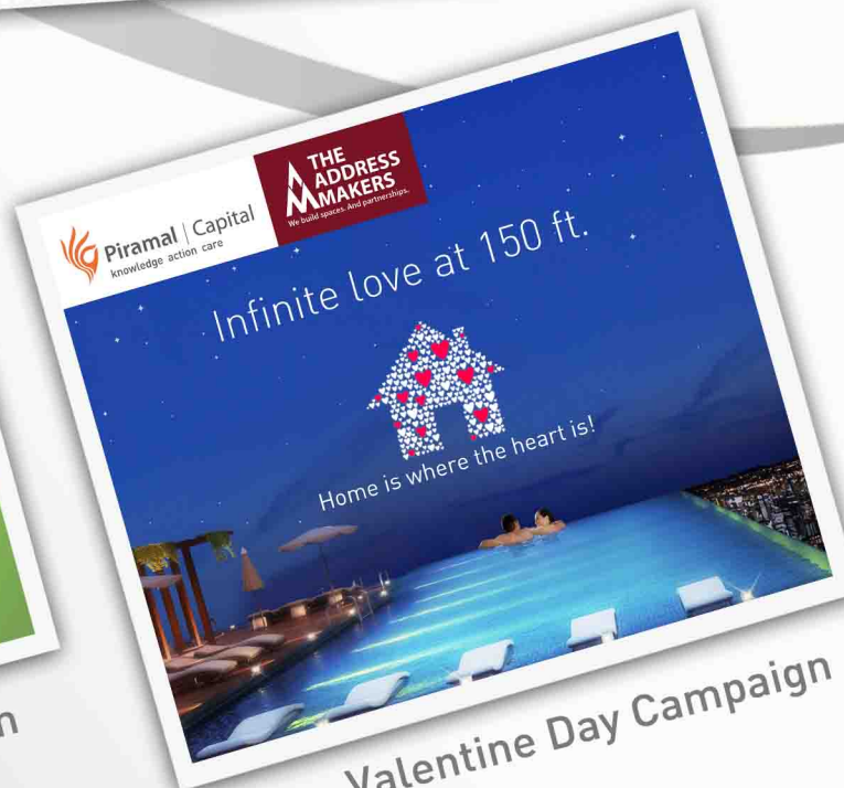
Valentine Day Campaign