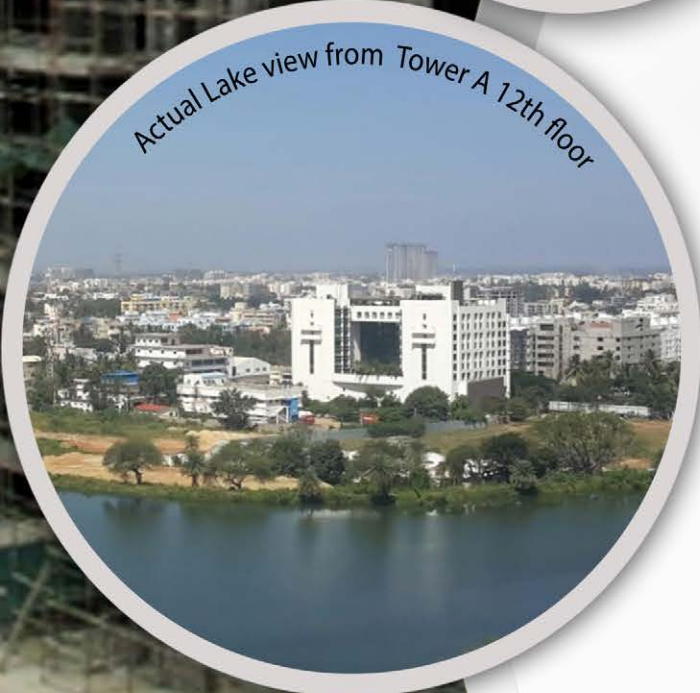
Actual Lake view from Tower A 12th floor