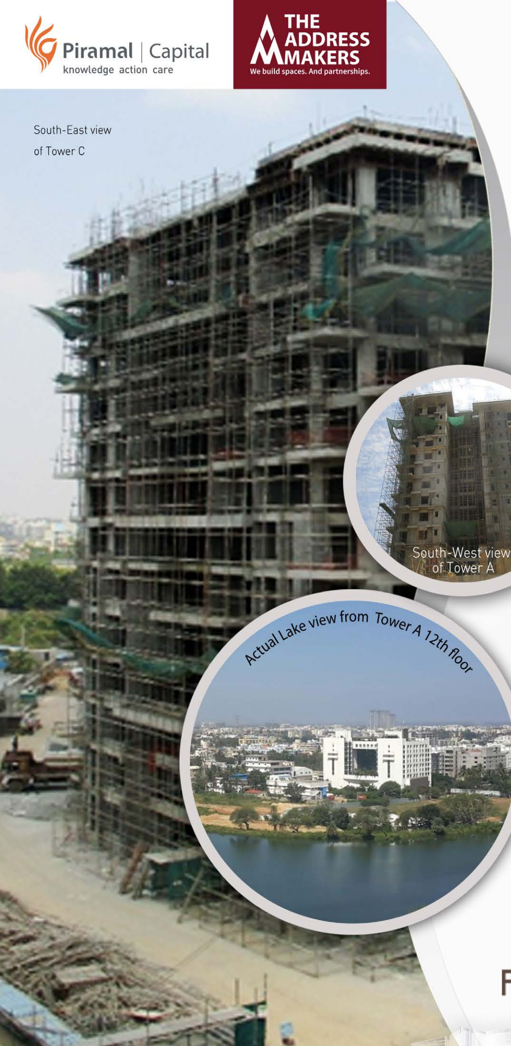
South-East view of Tower C