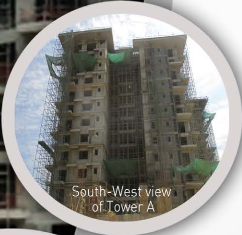
South-West view of Tower A