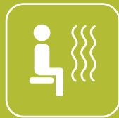
ellness Park- Jacuzzi & Steam Room