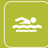
Swimming Pool with Toddler Pool