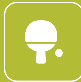
Indoor Games-Snooker, Table Tennis